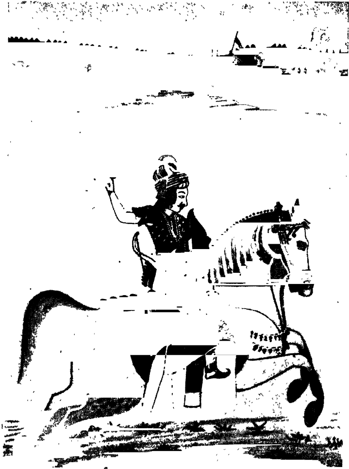
PESHWA BAJIRAO I